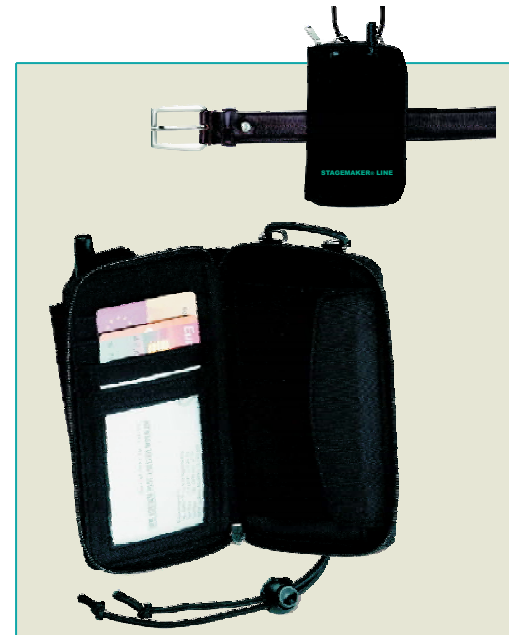
4/.BELT SUITCASE AND GSM HOLDER