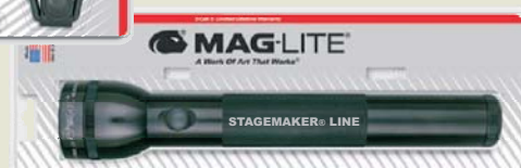
14/.MAGLITE® LIGHT (BIG MODEL) AND FIXATION BELT