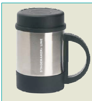
22./THERMAL MUG (0,30 LITER)