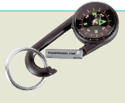
18./KEY RING Type 2