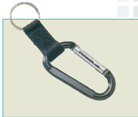
16./KEY RING Type 1