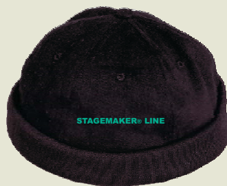
7/.BLACK CAP WITHOUT VISOR