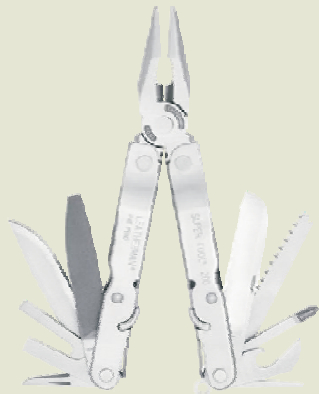
8/.LEATHERMAN® TOOLS SET