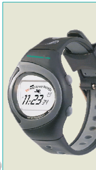
20./STAGEMAKER SPORT WATCHES