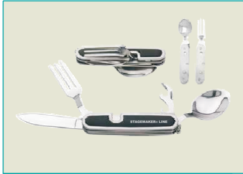
15./SET OF KNIFE, FORK AND SPOON