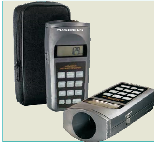
9/.LASER MEASURE TOOL