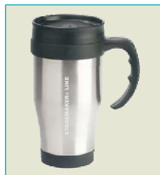
23./THERMAL MUG (0,35 LITER)