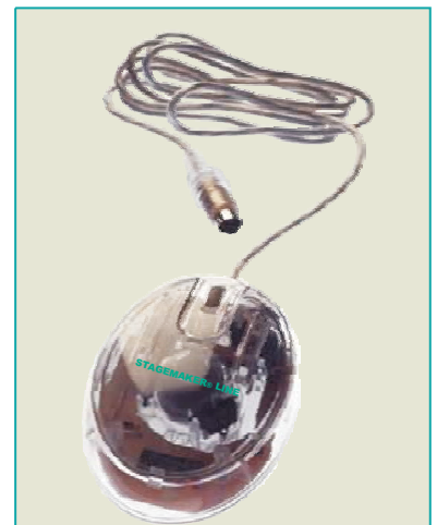
12/.TRANSPARENT PC MOUSE