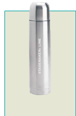
24./THERMAL BOTTLE (1 LITER)