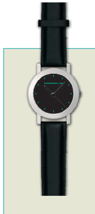
21./STAGEMAKER CLASSIC WATCHES