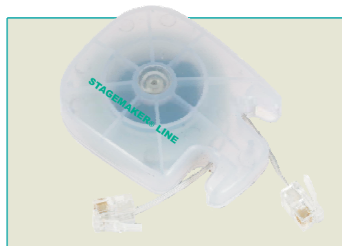
11/.NETWORK EXTENSION CORD